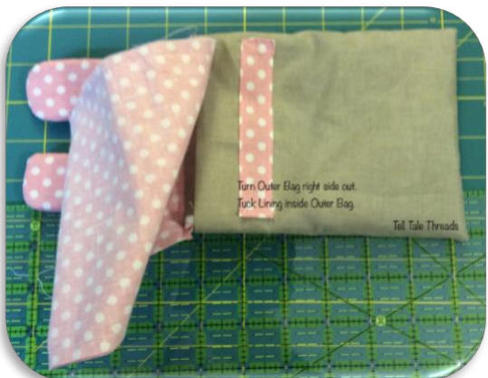
Step 7. Turn Outer Bag – tuck Lining into Outer Bag.