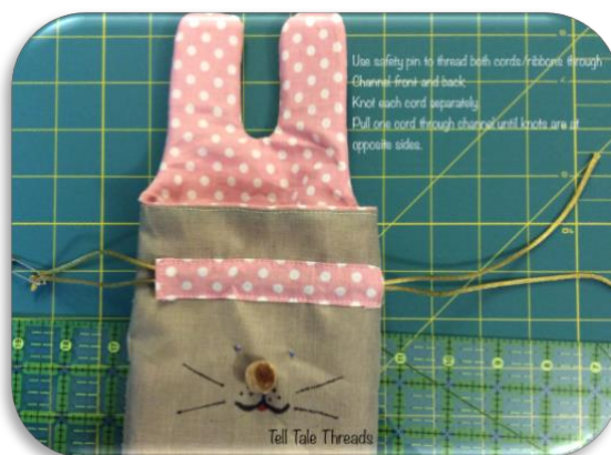
Step 11. Use safety pin to thread 2 cords together, through both Channels. Knot each cord. Then pull knot of one cord to the opposite side of bag.