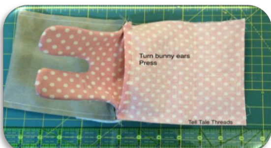
Step 6. Turn Bunny Ears. I used a Clover Hera Marker to get a nice crisp turn.