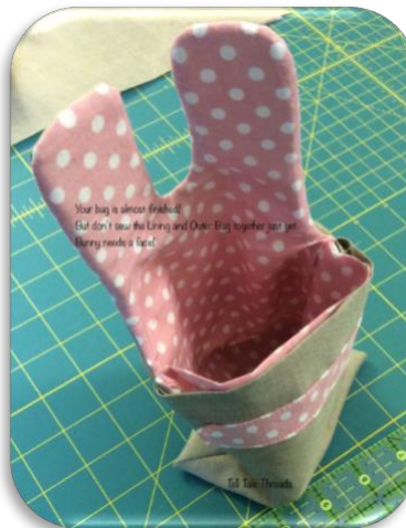
Step 8. Your Bunny Bag is almost finished! Don't sew the Lining & Outer Bag together just yet. Mark the facial features.