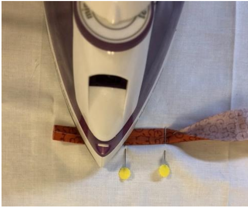
3. Using 2 pins, pin folded strip to ironing board - pinning close on either side of strip

Make drawstrings (this is an economical way to use what you have instead of buying expensive cording and tools)