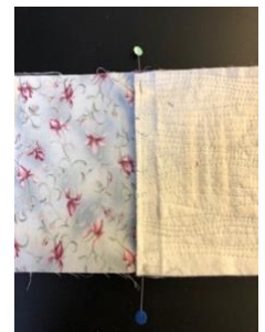
1. Align & pin seams before sewing